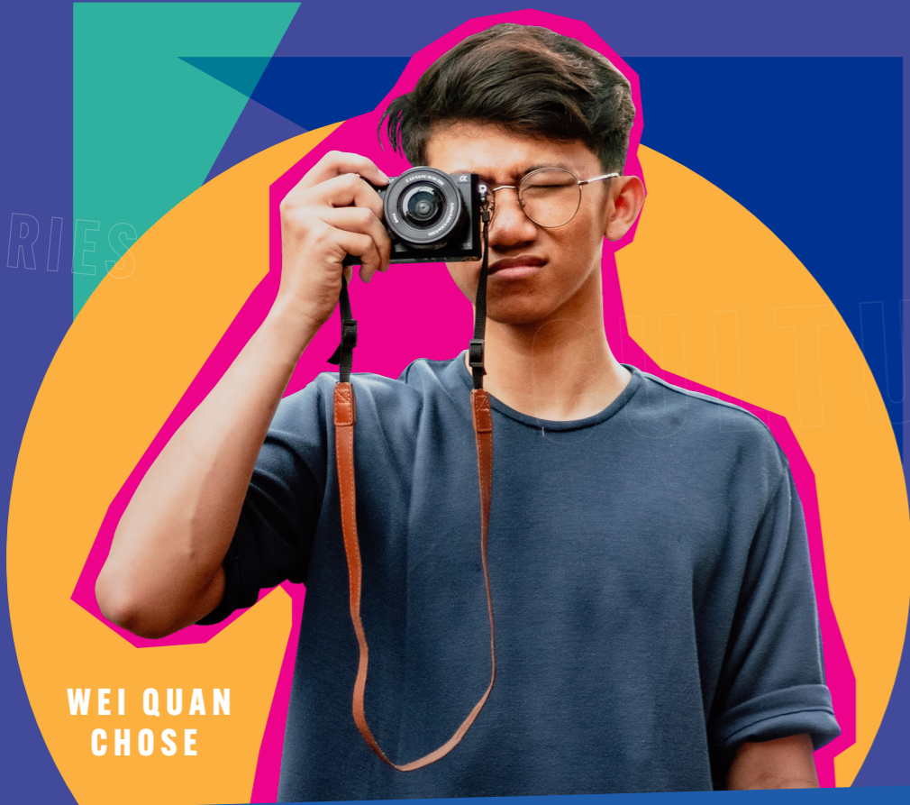
WEI QUAN CHOSE