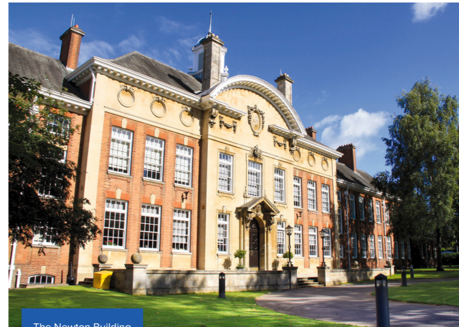
The Newton Building - Bosworth school features excellent facilities throughout

ADDRESS: THE NEWTON BUILDING, AVENUE CAMPUS, ST. GEORGES AVENUE, NORTHAMPTON, NN2 6JB